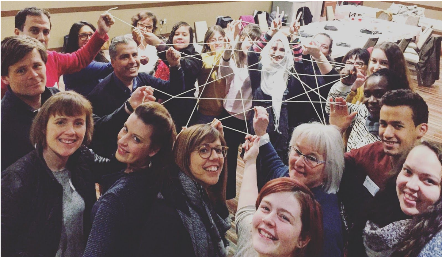
The Ottawa Student Writing Team