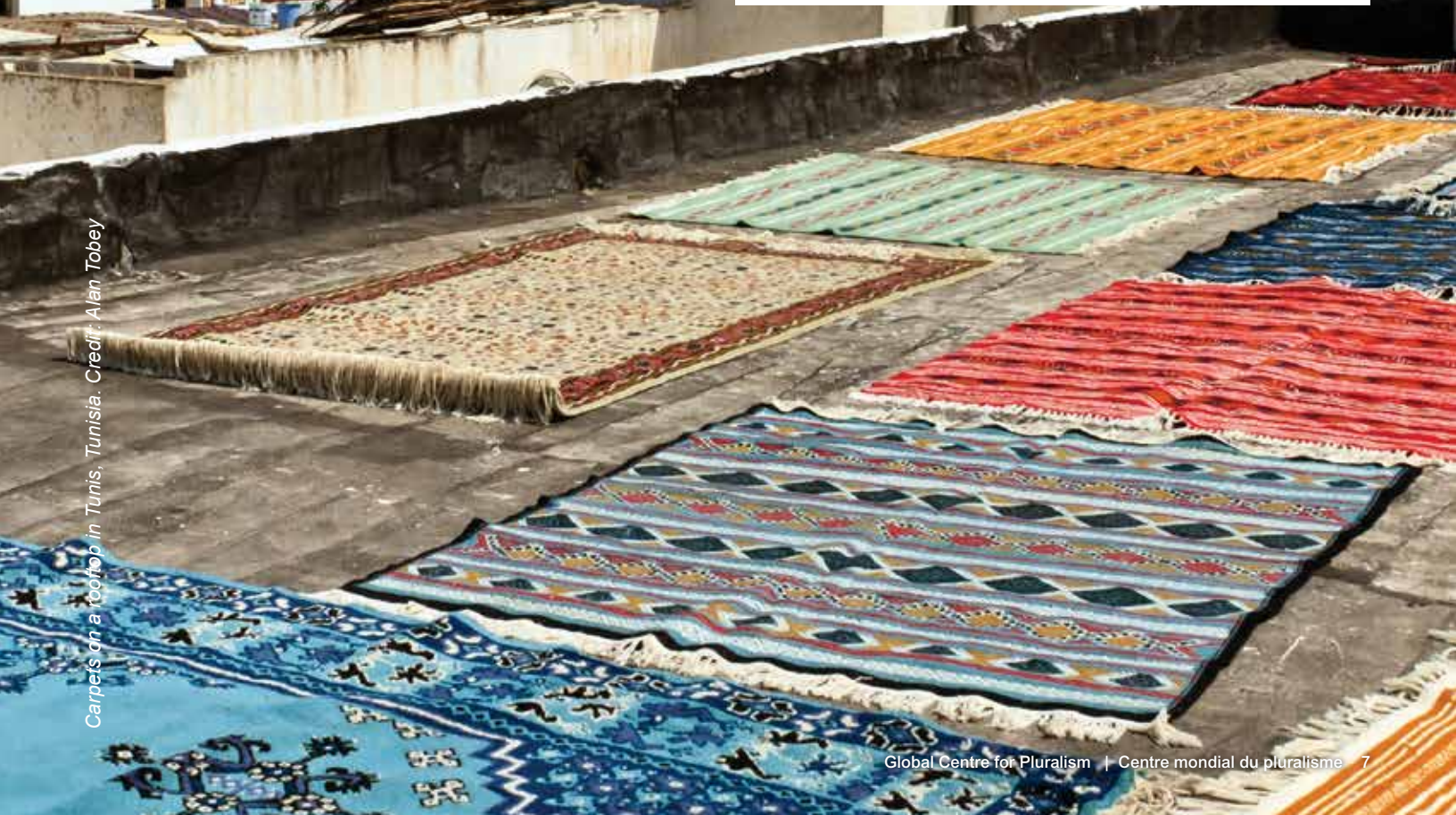
Carpets on a rooftop in Tunis, Tunisia.