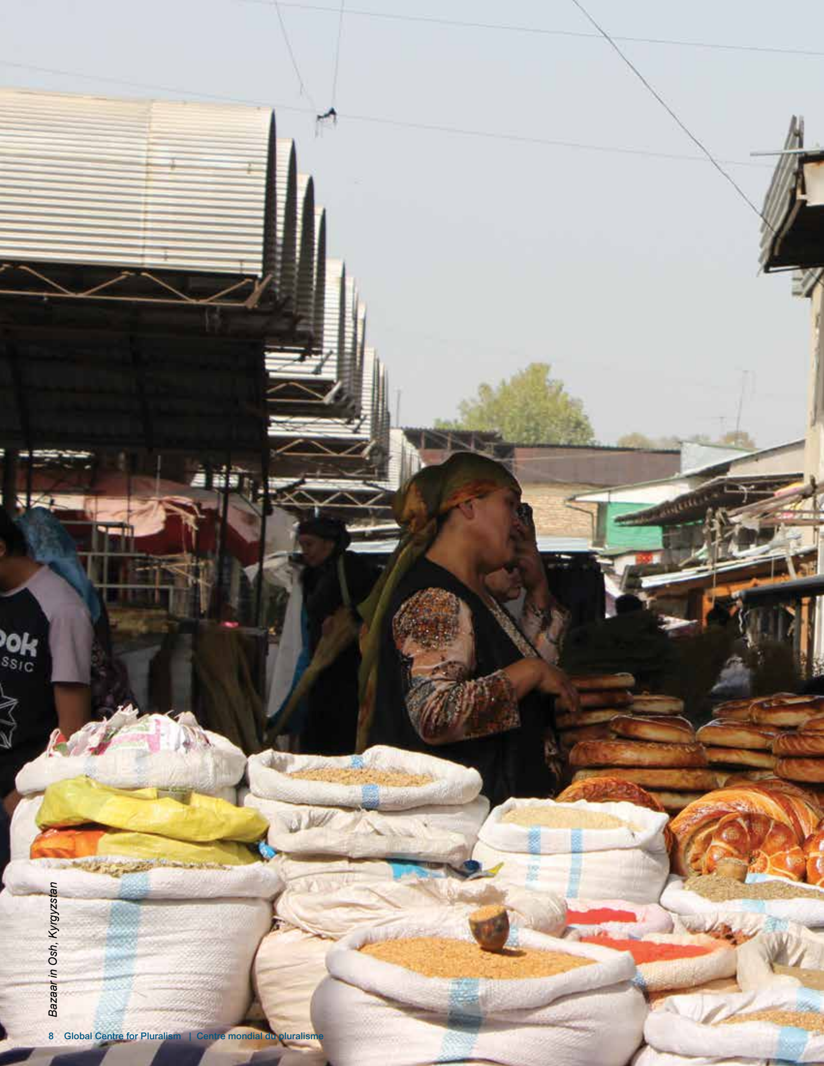
Bazaar in Osh, Kyrgyzstan