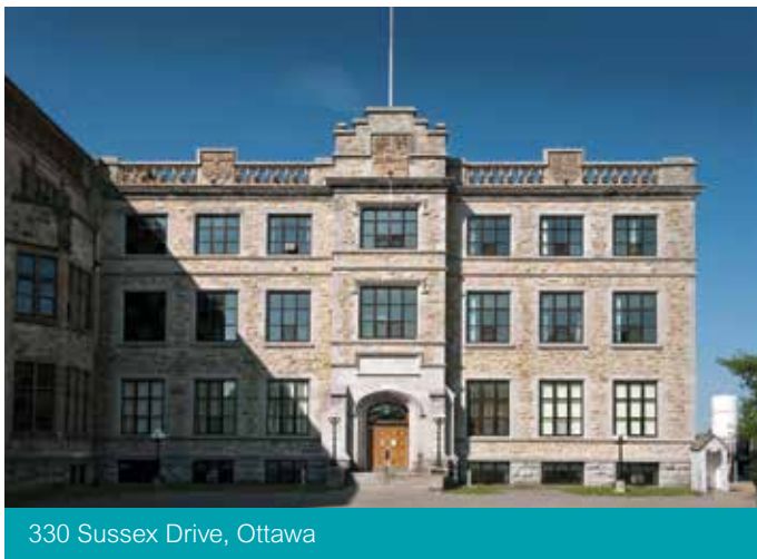
330 Sussex Drive, Ottawa

The prudent management of the Centre's operating costs, while supporting the ambitious program results for 2016, remain key priorities for the coming year. At the November 2015 Board of Directors meeting, the Board approved an annual budget for 2016 of up to $3.15 million. This total amount includes a special draw on the accumulated income of the Fund to accelerate programming and prepare for the Centre's public launch in 2017 at 330 Sussex Drive.