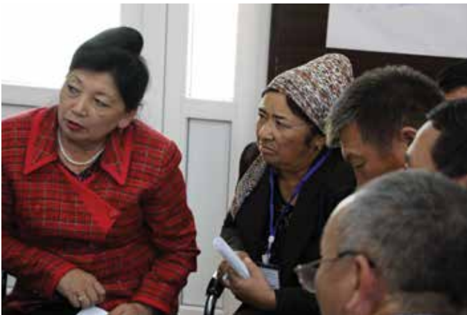
Pluralism workshop in Osh, Kyrgyzstan